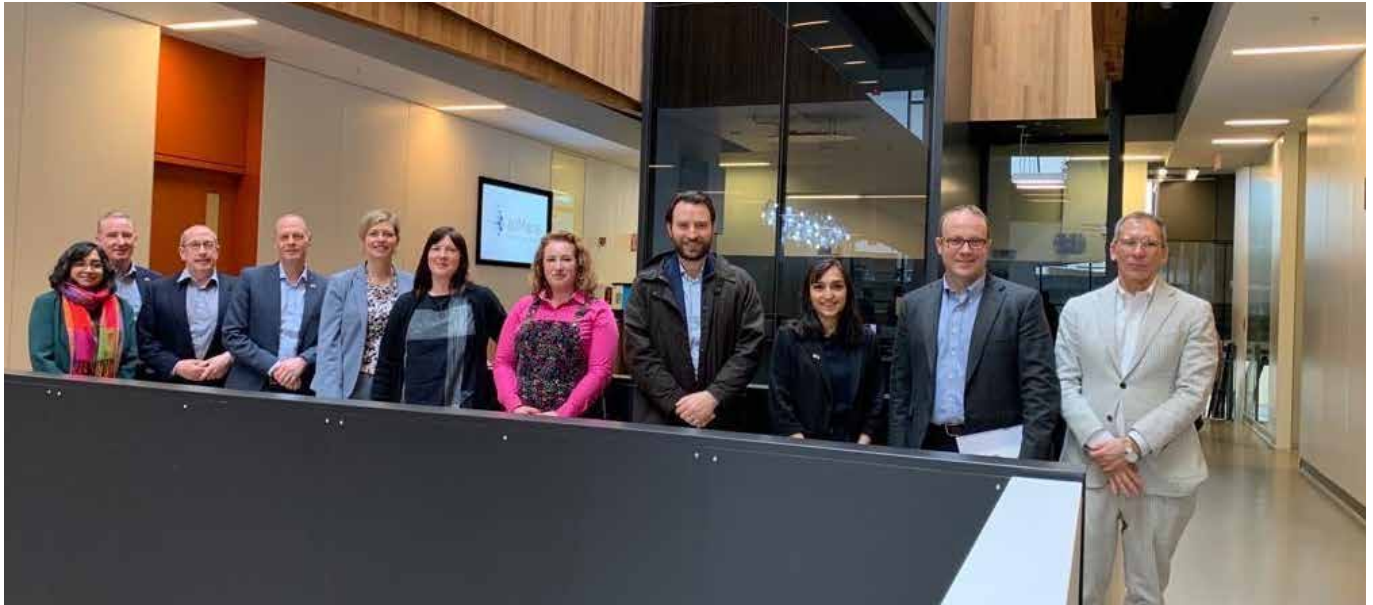
The UK delegation with colleagues from AdMare Bioinnovations and Health Canada

as part of the Government of Canada's Networks of Centres of Excellence 68 . CellCAN's mission is to improve the quality, safety and feasibility of cell and gene therapy in Canada through optimal manufacturing practices. The emphasis is on building a network, advancing regulatory standards, effective outreach, and positioning Canada as a world leader. There are parallels with some UK networks, in particular the ATMP Manufacturing Community (amc) 69 .