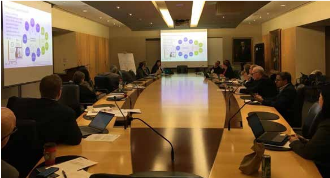
Discussions taking place between the UK delegation and colleagues at the University Health Network in Toronto

funded through the government's Canada First Research Excellence Fund 94 . Alongside research funding, it works to support clinical translation and commercialisation. With an international mandate, the delegation learned that 50% of their international collaborations are with UK groups. This highlighted the strong appetite for UK-Canada academic partnerships in the advanced therapies area, which will underpin long-term innovation collaboration.