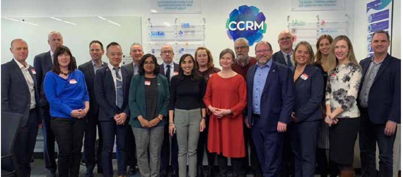
The UK delegation with colleagues from CCRM, Health Canada, SCN, Medicine by Design, iVexSol and Sernova

CCRM already has a franchise in Australia and an ambition to build a global network of similar hubs to reach c.1000 companies. A mutual “soft landing zone” for UK and Canadian companies looking to internationalise was also discussed.