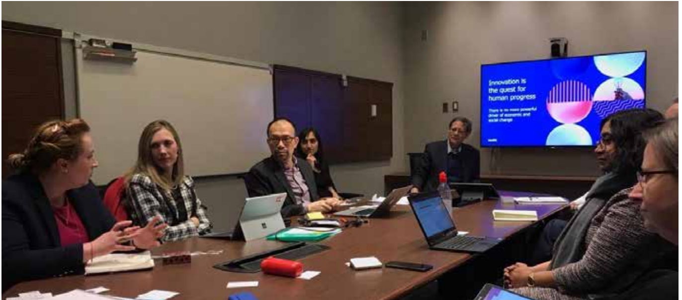
The UK delegation meeting with colleagues from MaRS in Toronto

SCN has generated a detailed landscape map of the Canadian regenerative medicine ecosystem (see Figure 1, page 8), for use to advocate for the sector and signpost for interactions. This could be used to help identify where it makes sense for the UK and Canada to collaborate. Additional networks and infrastructure that the delegation did not meet with, but which play an essential role in supporting ATMP research and innovation in Canada include the Canadian Institutes of Health Research (CIHR) 86 , the Centre for Drug Research and Development (CDRD) 87 , the National Public Cord Blood Bank 88 , the Canadian National Transplant Research Program 89 , and the Institute for Research in Immunology and Cancer – Commercialization of Research (IRICoR) 90 . The Council of Canadian Academies report provides more in-depth information on this summary 91 .