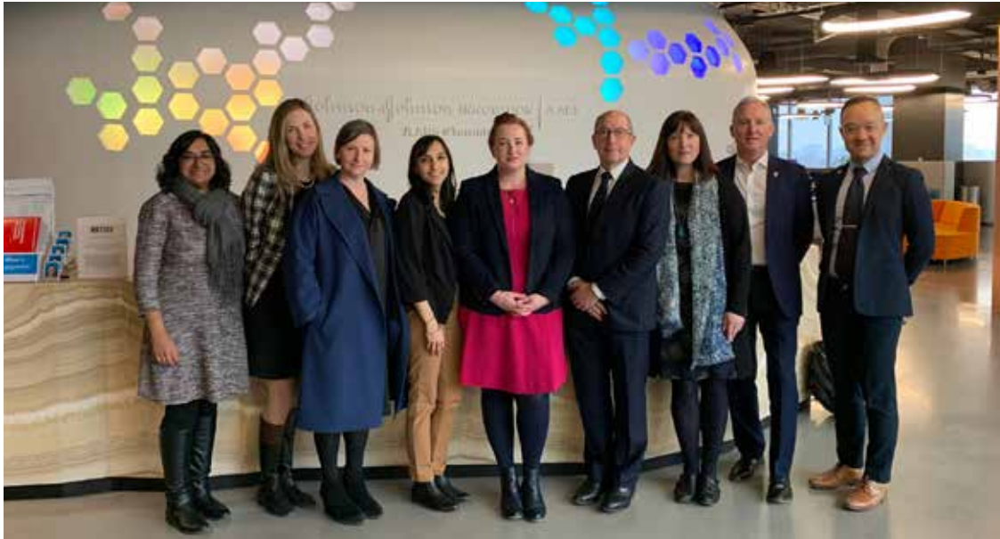
The UK delegation alongside Health Canada at J-Labs