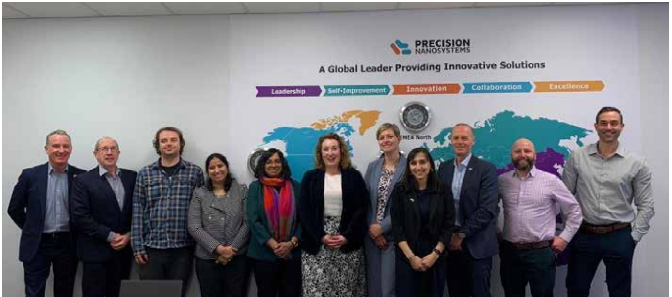
UK delegation meeting with Precision Nanosystems in Vancouver, Canada